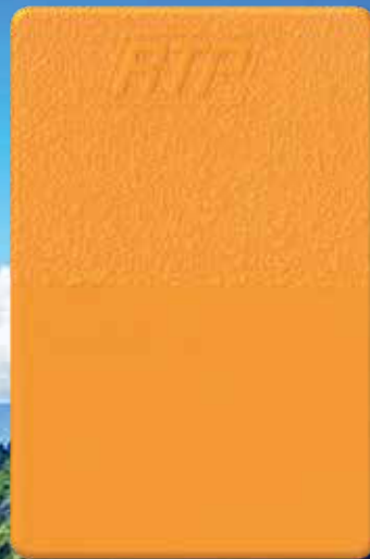
CLOWNFISH S-483103 MB 4% | Polypropylene (PP)