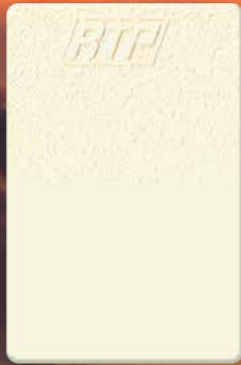
BONE-DRY S-206781 MB 8% | Polysulfone (PSU)

The light, neutral colours of the Arid Collection spark a sense of adventure, exploration, and connection to the earth. These warm, earthy tones are perfect material colour choices for household appliances, consumer goods, and visible plastic components.