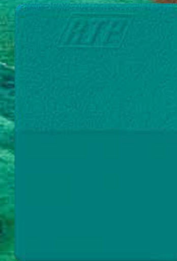
TYPHOON S-709749 MB 2% | Polypropylene (PP)