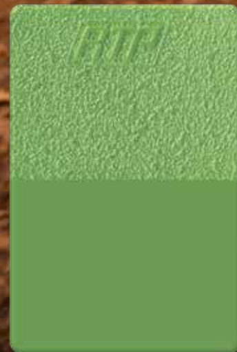
MEADOW-TATION S-903731 MB 8% | Polycarbonate (PC) Pearlescent