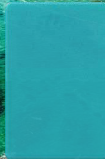
WATERFALL S-709748 MB 2% | Polypropylene (PP) Translucent

Hueforia engineers can develop material to fit the specific requirements of your application. For example, this rigid surfboard fin with an overmolded thermoplastic edge provides safety features and better board performance.