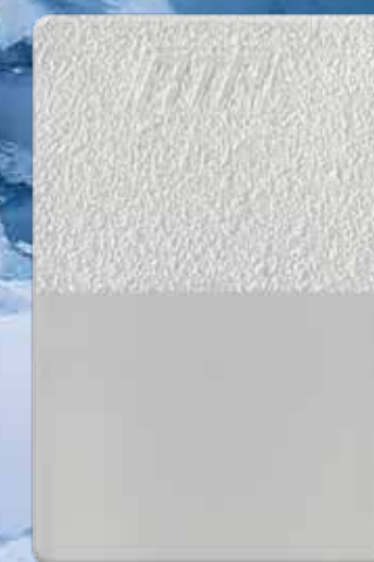
SHIVER S-903733 MB 8% | Amorphous Nylon (PA) Pearlescent