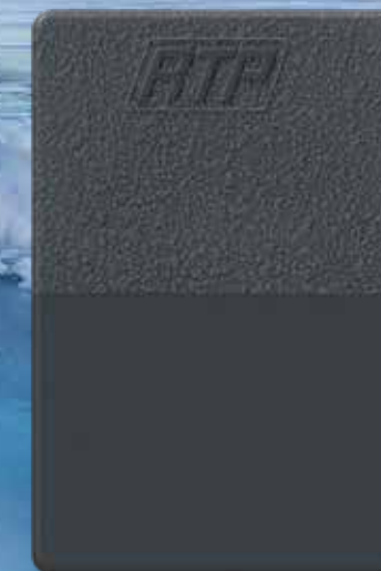
CRYOGENIC S-709747 MB 4% | Nylon (PA)