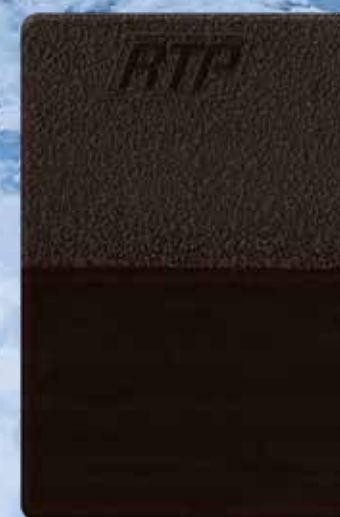
ORCA S-34237 MB 4% | Nylon (PA)