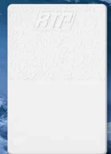
SNOWSHOE S-206780 MB 8% | Amorphous Nylon (PA)

Hueforia engineers design thermoplastic compounds for vehicles that perfectly balance properties such as strength, wear resistance, weatherability, and aesthetics, including colour in smooth glossy or matte finishes.