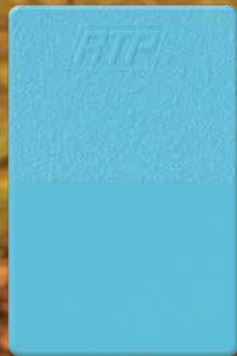
BALANCE S-709745 MB 4% | Polycarbonate (PC)