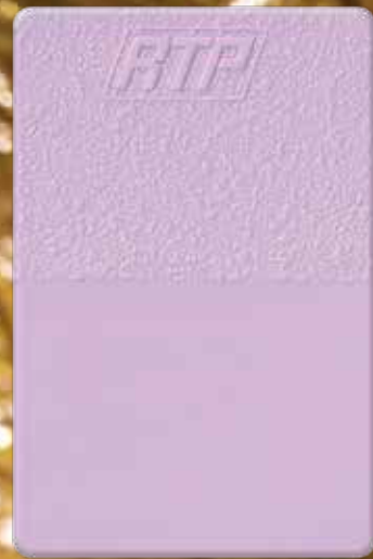
LUKEWARM S-781964 MB 4% | Polycarbonate (PC)

The sophisticated shades of the Temperate Collection bring a sense of quiet power, strength, and reliability to the plastic housings of electronic and medical devices, including wearables.