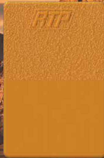
SAHARA S-483104 MB 4% | Polysulfone (PSU)