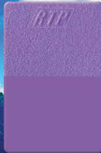
TANZANITE S-903735 MB 4% | Polypropylene (PP) Pearlescent

Inspired by the lush beauty of the rain forest, the Tropical Collection radiates wild, vibrant hues, ideally suited for thermoplastics being molded into toys, sporting goods, and entertainment accessories.