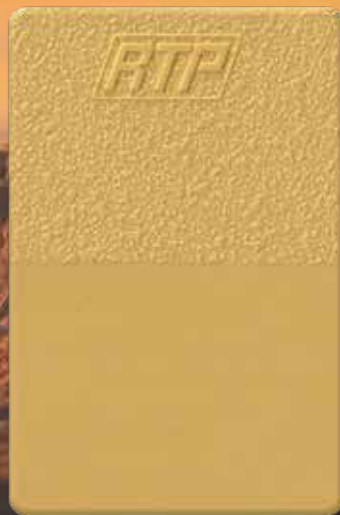
SANDSTORM S-46239 MB 4% | Polysulfone (PSU)