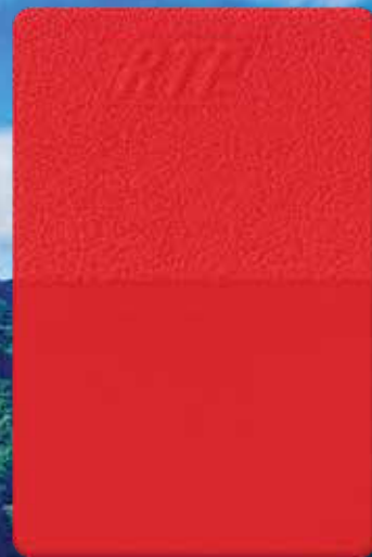
HOT TROPIX S-501033 MB 2% | Polypropylene (PP)