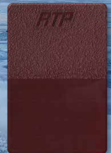
MULLED WINE S-903734 MB 4% | Nylon (PA) Metallic Medium Flake