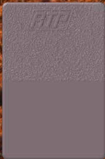
PARCHED PLUM S-781966 MB 4% | Polysulfone (PSU)