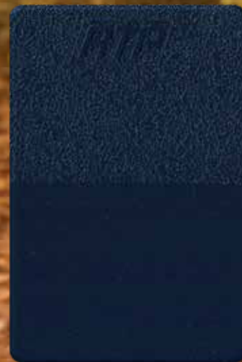
NIGHTFALL S-903732 MB 4% | Polycarbonate (PC) Metallic Large Flake