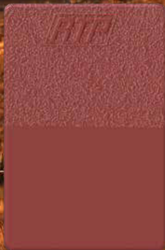
DESERT CANYON S-903740 MB 8% | Polysulfone (PSU) Metallic Large Flake