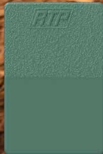
DECIDUOUS S-600380 MB 4% | Polycarbonate (PC)