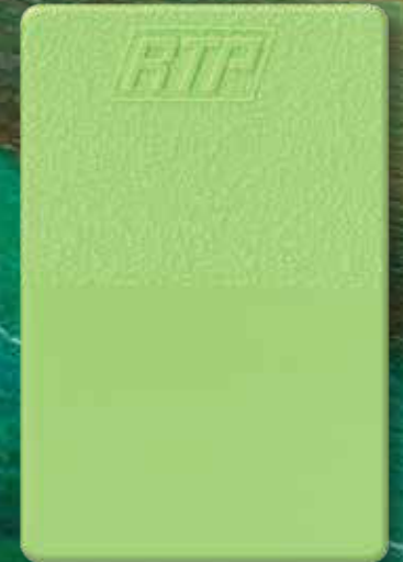
TREE FROG S-600381 MB 4% | Polypropylene (PP)