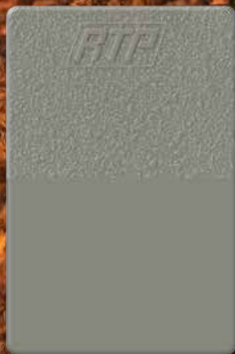
DUST IN TIME S-897347 MB 4% | Polysulfone (PSU)

Coloured thermoplastics provided by Hueforia can enhance the aesthetics of plastic components, such as water bottle lids and bases; these materials are FDA-compliant and available worldwide.