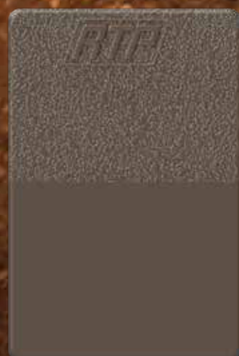
WALNUT S-34236 MB 4% | Polycarbonate (PC)

Everything from wheelchair gears to wearable medtech devices can benefit from the strength and wear resistance of coloured thermoplastic compounds that are specially formulated by Hueforia engineers.